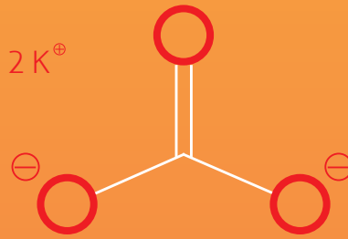
Potassium carbonate molecule

The potassium in FoliMAX NRG-NK is present as a citrate/carbonate complex. Having dual forms of potassium optimises availability of the nutrient, both via the leaf and the soil. The potassium citrate component provides a citrate molecule which is found in all plants, and this form of potassium is immediately recognised and assimilated by the plant maximising leaf uptake. The potassium carbonate form is ideal for plant uptake in the soil environment and also has the additional benefits of enhancing disease resistance properties within the turfgrass plant.