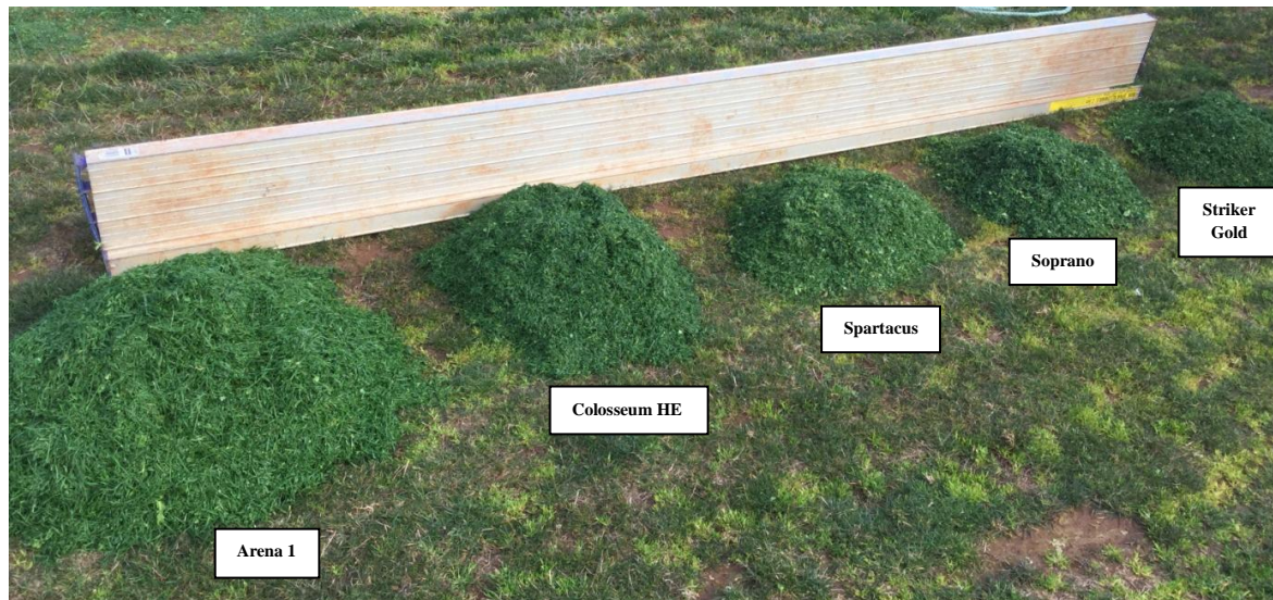
Photo 1: Freshly harvested clippings from single replicates (19.5m 2 area), 26 th August.

yield than Colosseum HE, and 200% higher yield than the Continental cultivars. This difference is seen clearly in the freshly harvested piles from a single replicate, shown below: